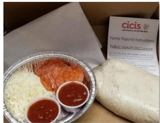
Family Pizza Kit

Due to the temperature sensitivity of this product, your organization collects at the time of sale, remits 50% of all sales back to CiCis, picks up the orders at 10am on a specified day and delivers all by noon that same day.